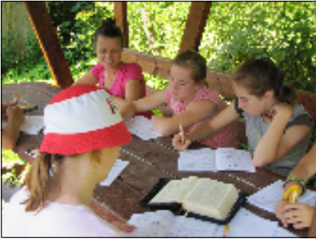
Above and below - the summer camp near Tachyv